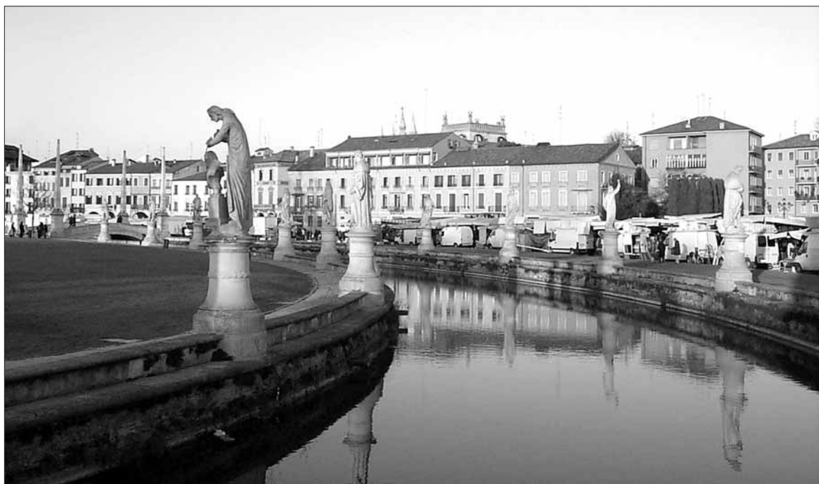
Some of the 78 existing statues positioned in Prato della Valle, a 90,000 square-meter elliptical square located in Padova. The square – the largest in Italy is also one of the largest in Europe. The entire project, which was never entirely completed, started in 1775 when Andrea Memmo, a patrician Venetian, decided to reclaim this big area that at the time was nothing but swampland and to transform it into a public use. On Apr. 27, lots of events will be taking place in this square before and after the Padova Marathon.

takes place on April 13. The course starts at 9:15 a.m. from Via Po and finishes in Piazza Castello , full information in English from www.turinmarathon.it