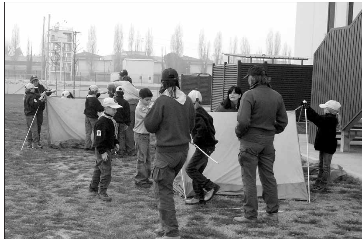
Scouts and leaders erect tents and practice their outdoor skills on the North-40 during Saturday's events.