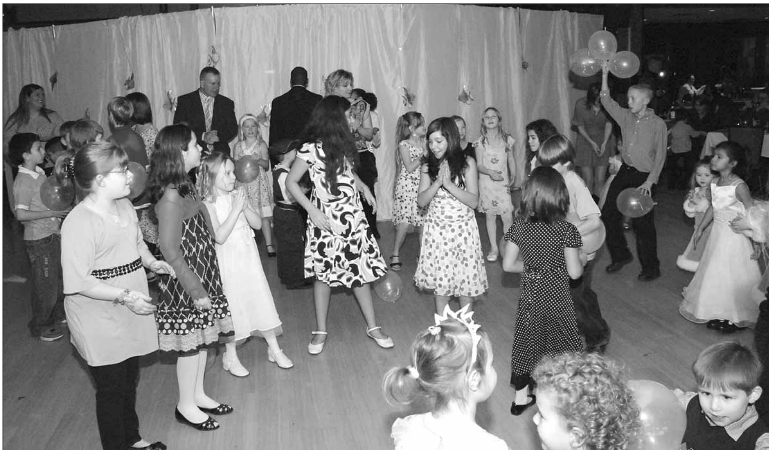
(Left) Parents and children alike enjoy playing and dancing at "Never neverland - Parent Child Dance" held at the Club Veneto.

The event coordinated by MWR, was an opportunity for nearly 100 people to enjoy an evening of fun, food and dance. Families also had the opportunity to have their picture taken together.