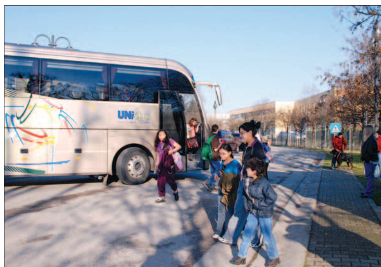
Students meet their parents at one of the five bus stops in Villaggio. Most students and parents are at the morning stop at 7:25 a.m. and the afternoon stop at 3:15 p.m. to catch the DoDDS school buses.

It is important to the Vicenza Student Transportation