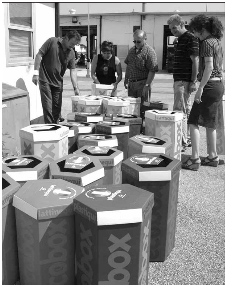
Workers sort through recycling containers like those found all over Caserma Ederle. Recycling keeps us in accord with the law, but it also helps save the environment. From March 10-14, a team will inspect Caserma Ederle for the three yearly External Environmental Protection Assessment. The primary purpose of an EPAS is to review the environmental performance status of the installation and recommend modifications necessary to enhance compliance and overall environmental management.

Environmental stewardship is everyone's duty and we want to keep USAG Vicenza as an example for other garrisons.