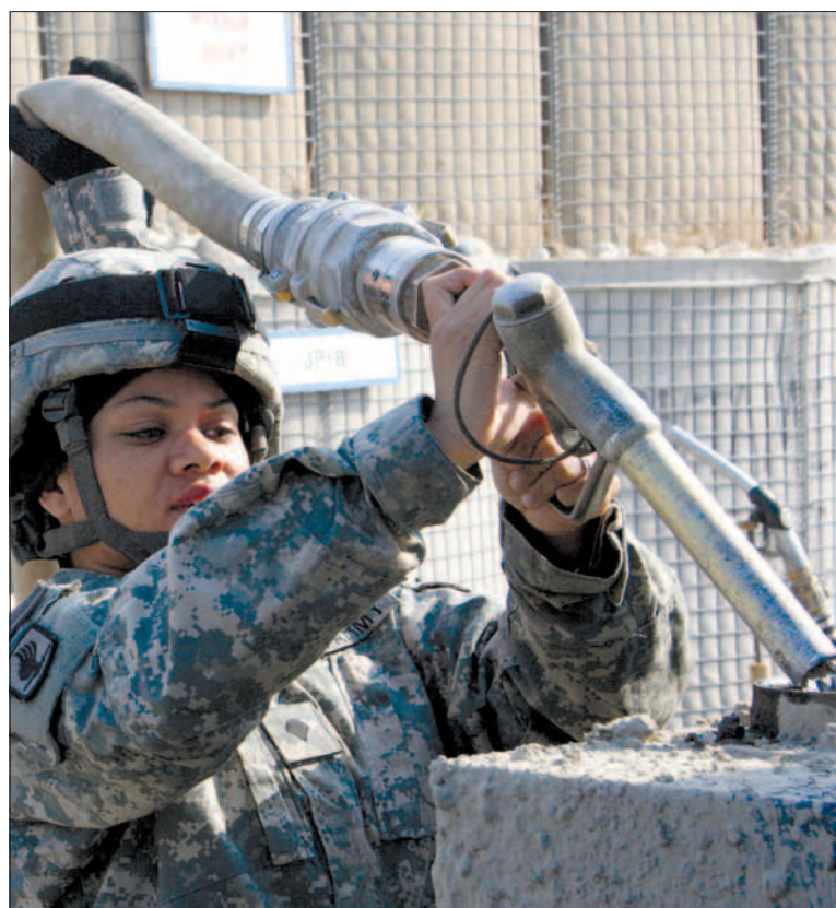
(Above) A paratrooper from the 173rd Brigade Combat Team tops off the tank of a fork lift at the FOB Fenty refueling point.

Until August, when the task force is expected to redeploy, they'll keep the fuel flowing so TF Bayonet can keep moving.