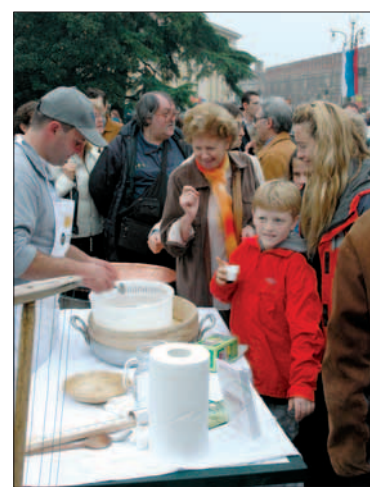
(Left) A vendor serves samples of fresh mozzarella at a cheese market in Verona. (Far left) Sightseers and towns people pass under the Roman-era Porta d'cei Borsari gate in Verona.