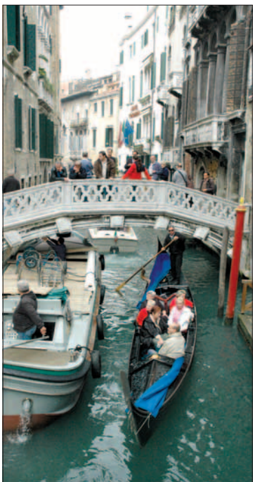
A gondola makes its way under a bridge and through one of Venice's many crowded canals.

One way to avoid that is to narrow one's scope and to concentrate on a specific city or region. Italy's Veneto Region offers just that opportunity — a chance to dip into the mild waters of Lake Garda, walk in Roman footsteps in Verona, munch on olives and cheese while sampling different wines in Soave and mingle with pigeons and parades of people in Venice.